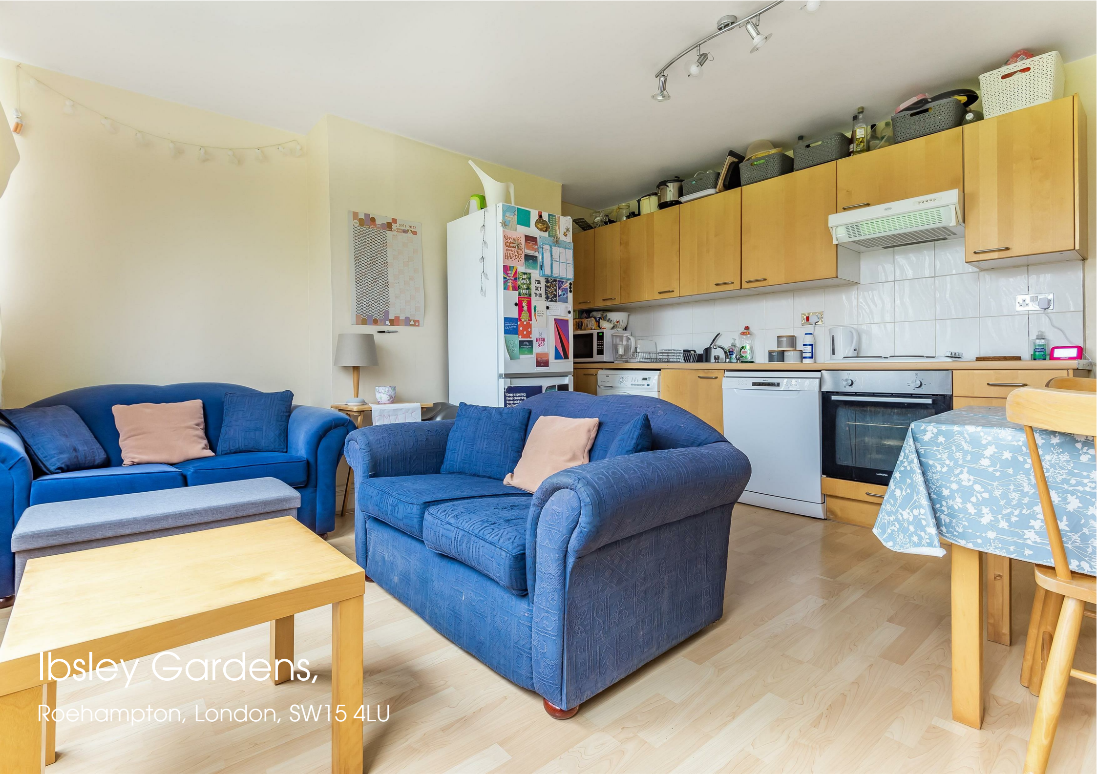
Ibsley Gardens, Roehampton, London, SW15 4LU